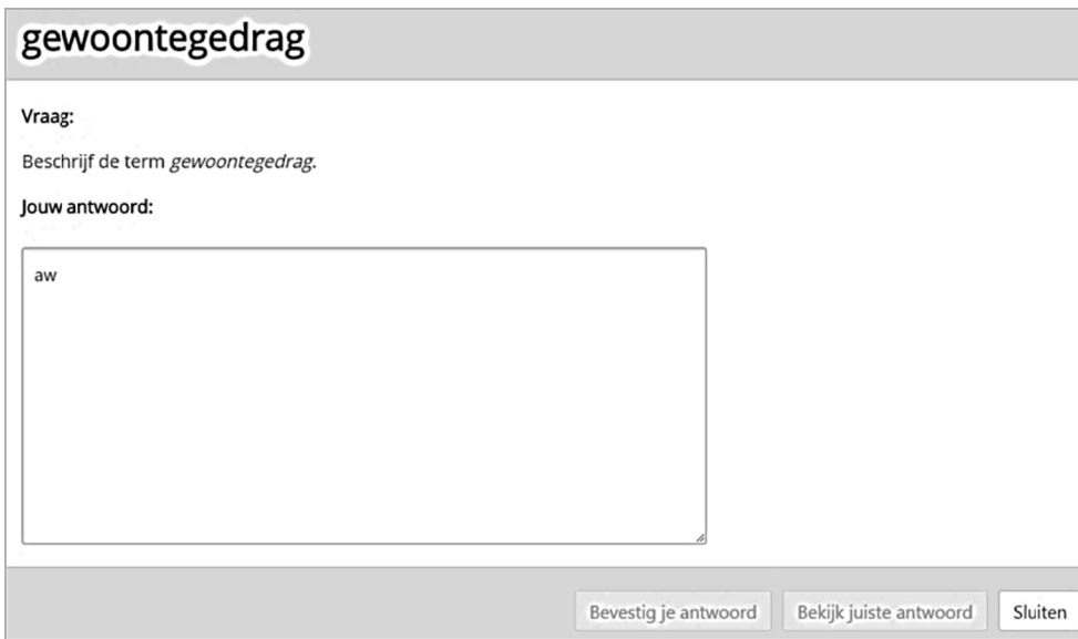
Fig. C2. Print screen of pop-up window for testing option in online learning environment for key concept habitual behavior ('gewoontegedrag' in Dutch). The question ('Vraag') Please describe the key concept habitual behavior ('Beschrijf de term gewoontegedrag.') is presented for which an answer can provided in the text below ('Jouw antwoord'). After entering an answer, students confirmed their answer ('Bevestig je antwoord') and could either compare it to the correct answer - the feedback option ('Bekijk juiste antwoord') or close the window ('Sluiten').