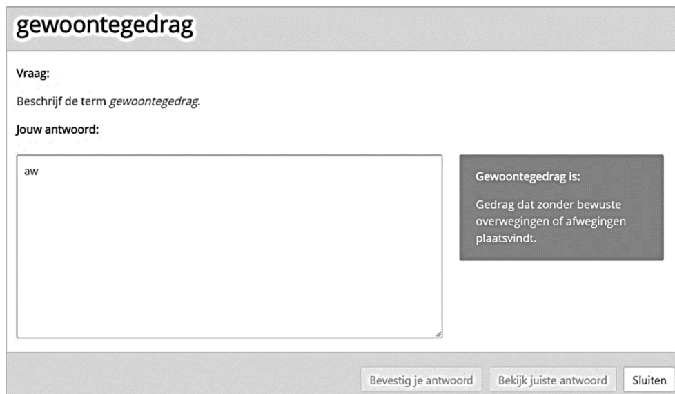
Fig. C3. Print screen of pop-up window for testing with feedback option in online learning environment for key concept habitual behavior ('gewoontegedrag'). The question ('Vraag') Please describe the key concept habitual behavior ('Beschrijf de term gewoontegedrag.') is presented for which an answer can provided in the text below ('Jouw antwoord'). On the right side, the correct answer is provided after clicking 'check correct answer' ('Bekijk juiste antwoord').